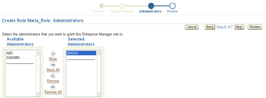
Figure 3 Granting Role

8. In the Create Role Administrator page (Figure 3) she grants Maria the role.